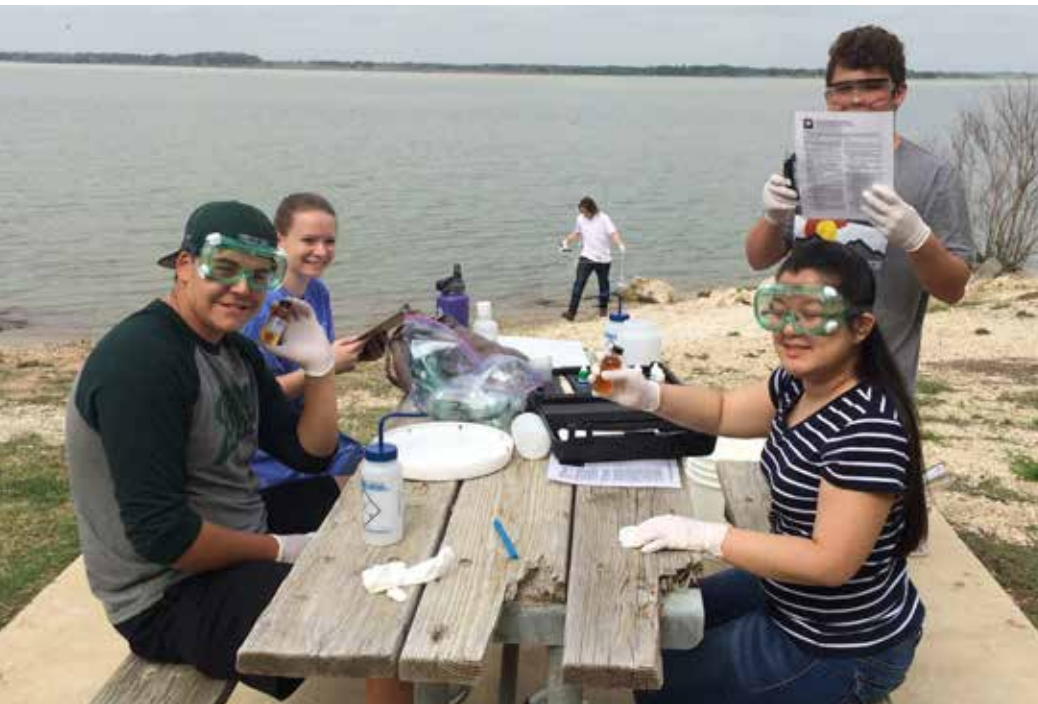
Students from Vanguard College Preparatory School use their new Texas Stream Team equipment to conduct monthly water quality samples on Lake Waco.